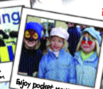
Enjoy pocket money prices