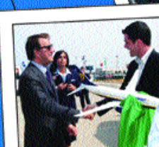
ugly bloke is welcomed by The Family!