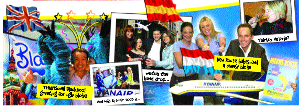
Traditional Blackpool greeting for ugly bloke!