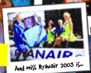
And Miss Ryanair 2003 is...