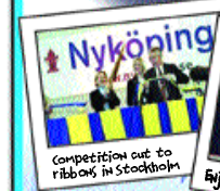
Nyköping Competition out to ribbons in Stockholm

This year we decided to smash up the SAS high fares monopoly in Scandinavia and we met with huge support from the Scandinavians...well except for those working at SAS! Our new Scandinavian base will result in the creation of over 200 new jobs and over 1.5 Million new passengers being carried through Stockholm Skavsta in the first year of this new base! There are No Dumb Blondes in Sweden!