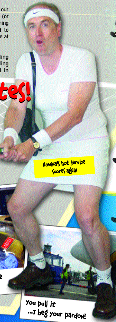
Howina's hot service scores again