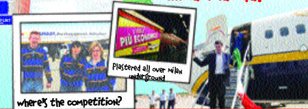
where's the competition?