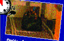
Passengers and Bags offloaded...