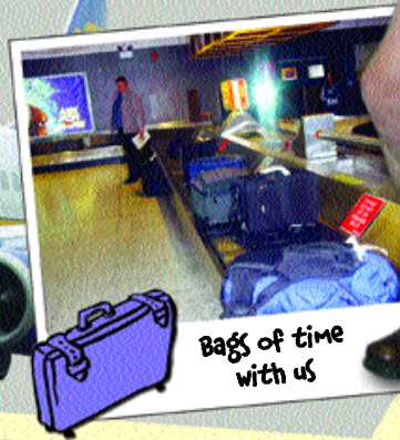
Bags of time with us