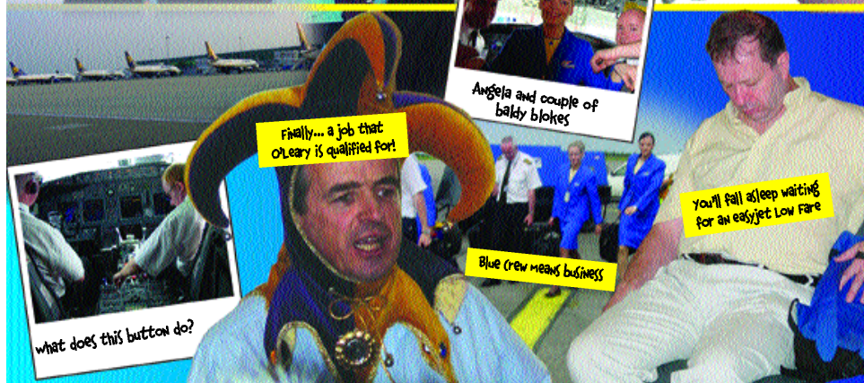
Finally... a job that O'Leary is qualified for!