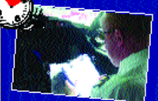
Checking it twice...