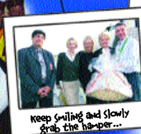
Keep smiling and slowly grab the hamper...