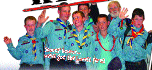
Scout? Honour... we've got the Lowest Fares!